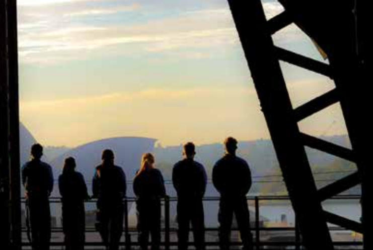
Pictured: BridgeClimb Sydney