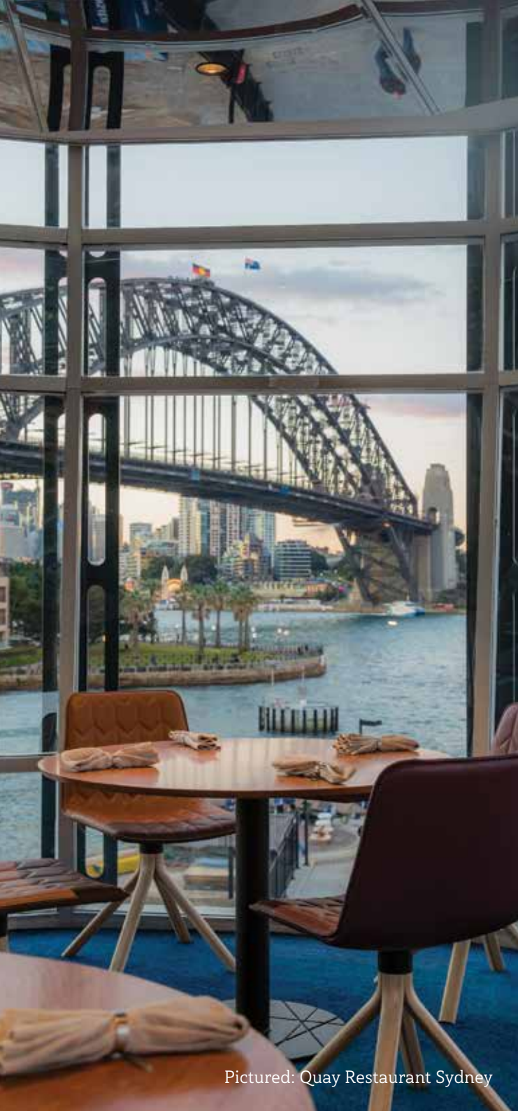
Pictured: Quay Restaurant Sydney